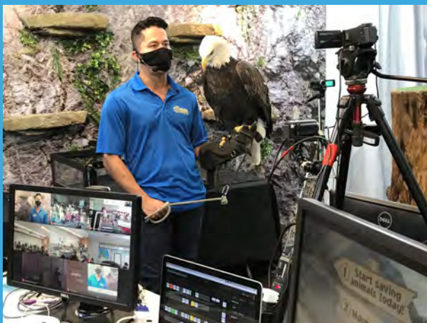
Behind the scenes of our dynamic display