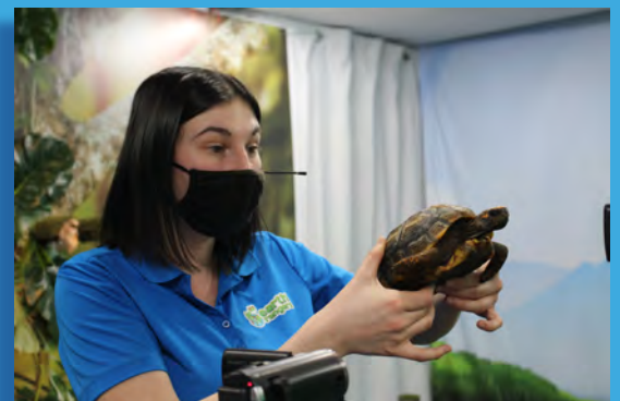
St. Patrick School Assembly, January 12, 2022