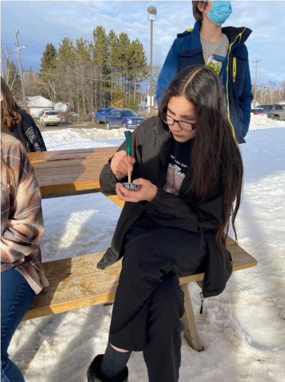
← Image 1: Grade 7 student trying out a pot & striker turkey call, Open Roads Public School, Dryden ON.