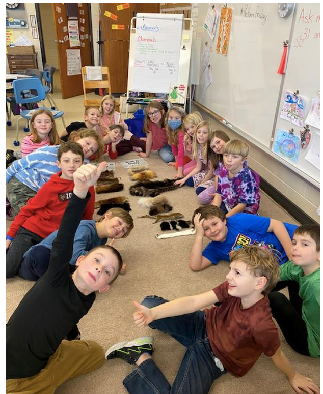
→ Image 2: Grade 2 students learning about mammals and their pelts, Charles C. McLean Public School, Gore Bay, ON.