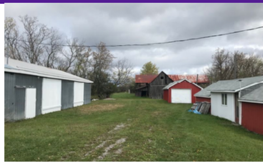
Above: Renovations were started on the buildings to the left and right

Work began this year on an ambitious two-phase plan to re-locate the headquarters of our turtle hospital and education centre currently located in Selwyn, Ontario to a 42.5 hectare property on Television Road in Peterborough, 10 minutes away from our current location. The project has been made possible through the generosity of Mary Young and Gerry Young, current owners of the property on Television Road. The new location will provide much needed space for our hospital and hatchling facility, and will enable us to sustainably meet demands at the steadily increasing level of