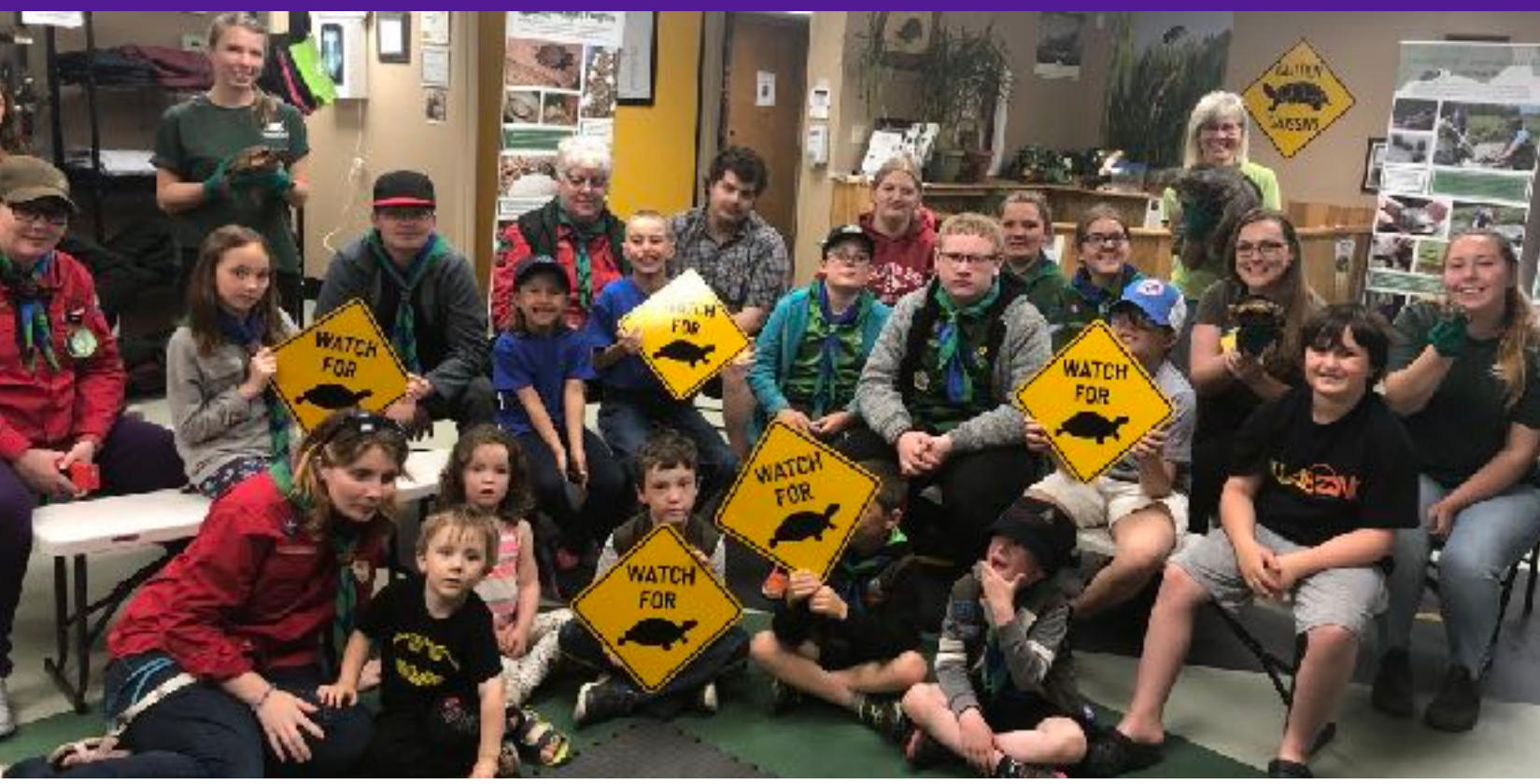
Above: 1st Hasting Scouts enjoy a workshop at OTCC's Education Centre in June 2019.

Throughout 2019, our Education and Outreach program continued to increase public knowledge and involvement in turtle and wetland conservation. 10,000 people of all ages and backgrounds attended